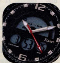
The Compendium: The spectacular face of the latest watch technology.