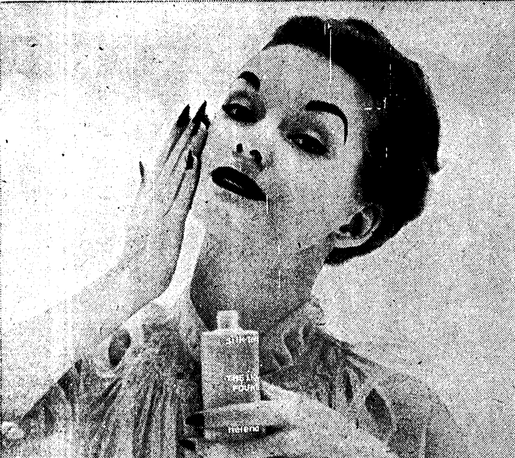
Helena Rubinstein's Silk-Tone Foundation is blended with pure atomized silk, to give dry skin dewy freshness and silken allure. It clings for hours without re-touching. And all the while, Silk-Tone acts like a beauty treatment... smoothing, softening and protecting complexions against winter weather.

The newest and most exciting way to wear your hair is—glided! It's the new jewelled look for hair, and there are several ways to do it—with a daring golden forelock... with light feathered touches all over for shot-with-gilt glamour. Either way, you can do it to a beautiful turn with Helena Rubinstein's GOLD TOUCH. GOLD TOUCH is liquid "gold"—you paint it on as easily as you do lipstick. The effect is ravishing—perfect for a dramatic entrance, cocktails at five or whenever you want to impress a man. Also in SILVER, 1.50 plus tax.